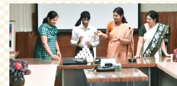
Teachers participating in an activity