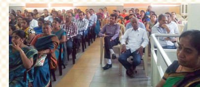
Parents of holy child high school students involved in session