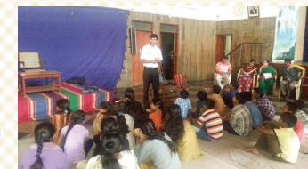
Students interacting in "Success as I see" Session