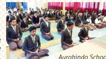
Aurobindo School Students involved in Yoga Session